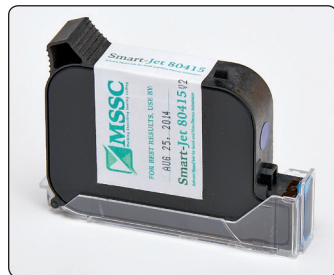
HP TIJ 2.5 technology